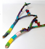
( www.two-daloo.com )

and the 'Stick Rattle'. Follow the links embedded in the instrument titles or follow the instructions found on either side of this story to create these fun natural musical instruments!