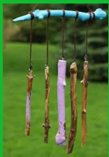
( http://happyhooligans.ca )